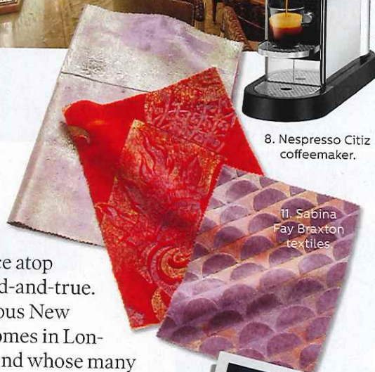
11. Sabina Fay Braxton textiles.