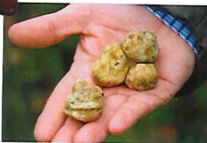
4. White truffles.