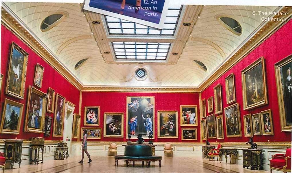
6. The Wallace Collection.