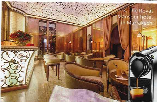
3. The Royal Mansour hotel in Marrakech.

In the past year, I've enjoyed Hamilton , The Color Purple , Fiddler on the Roof , An American in Paris , and Kinky Boots .