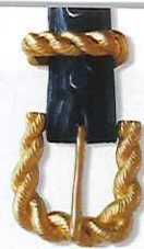
10. David Webb belt buckle.