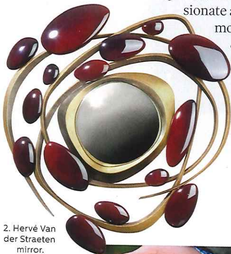
2. Hervé Van der Straeten mirror.