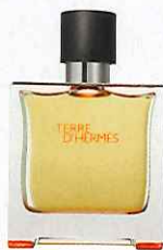
5. Terre d'Hermès cologne.